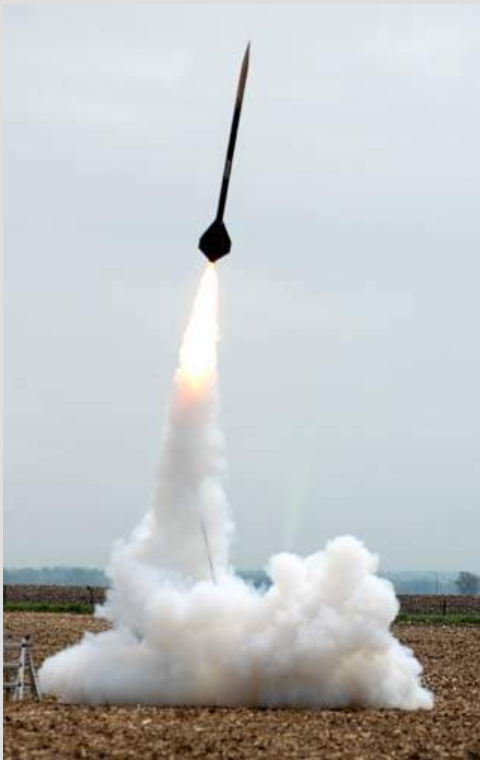
Doug Jackson's Scratch Built Purdue rocket on 2 J570's.