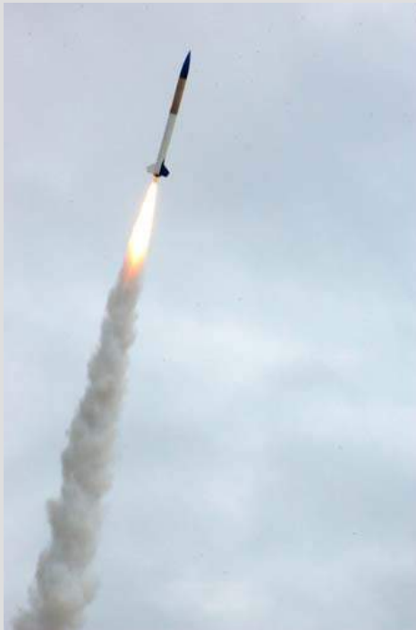
Paul's Magnum flying on a K550.