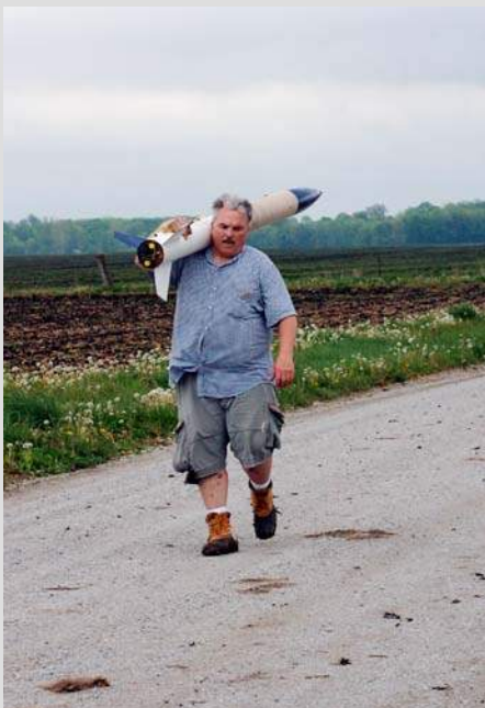
Walking back to the flight line after a successful flight.

Although it looked like rain more than once during the day, it held off long enough for us to get packed up and on our way.