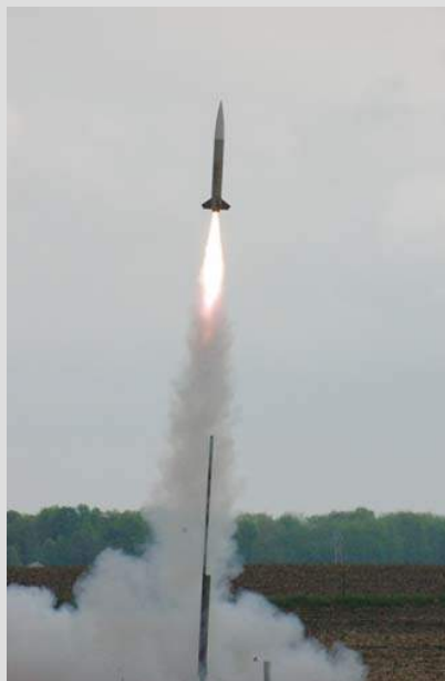
Roger Jeezler's scratch built Mad Max on a L1500 Wayside White.