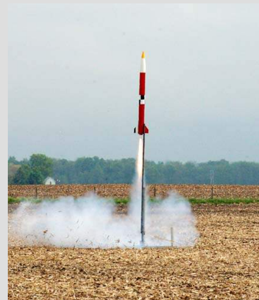
Ken Herrick's 1/2 scale PML Patriot flying on an M3000 Tigertail.