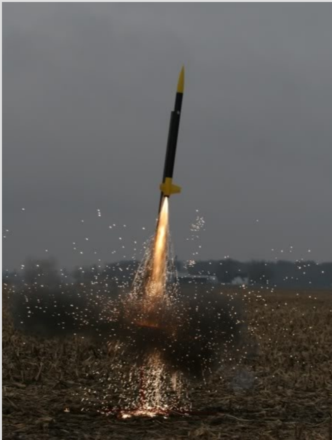
David Resses' Scratch built rocket on a I180 Sparky motor.