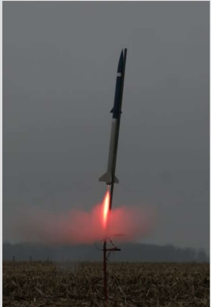
Dave Porter's rocket flying on a H148 Redline