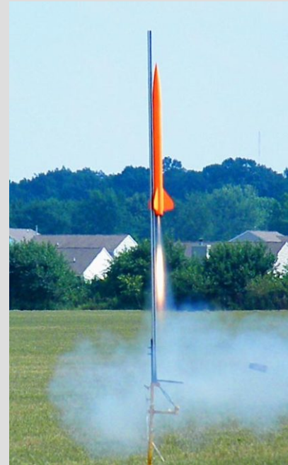
Randy Milliken's Wildman Jr. on a G185 Scalded Tiger.

The next launch is scheduled for September 13th at Purdy Sod Farm. Class 1 rockets only! (Up to 3.3 pounds and 125 grams of propellant almost all H motors are ok so Level 1 certifications ARE permitted).