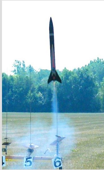
Carl Kruger's Executioner on an AT F39