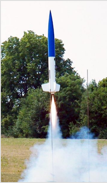
Curtis Reynolds Binder Design Excel on an AT E15