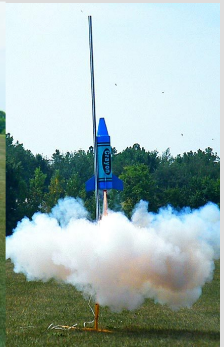
Curtis Reynolds with his successful level 1 rocket, a 6" crayon flying on a AT H128W motor.

For the month of August, we had a two day launch at Purdy Sod Farm. The sky was extremely clear and the sun was bright...an HOT!